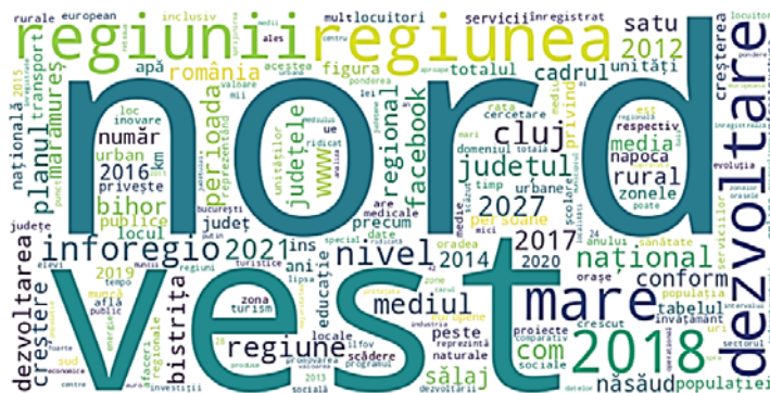
Figure 6. Word cloud based on the North-West Region Development Strategy