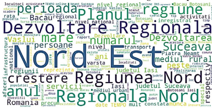
Figure 3. Word cloud based on the North-East Region Development Strategy